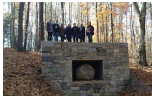
Contemporary Practice at Alnoba. Andy Goldsworthy, Watershed Boulder, Stone and Organic Materials, 2015/2016